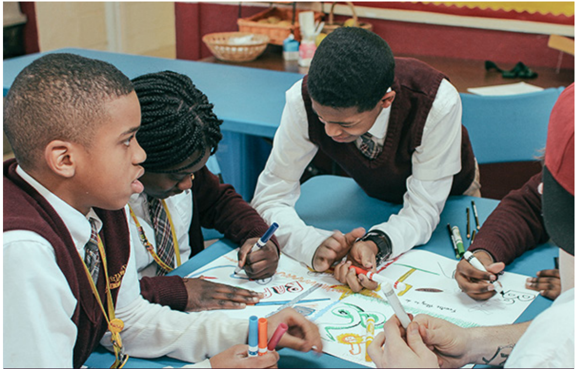
St. James 7th graders practice working together on a collaborative art piece .