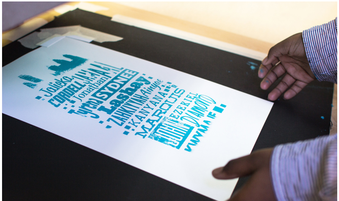
Students practiced by printing typographic silkscreen posters featuring their names.