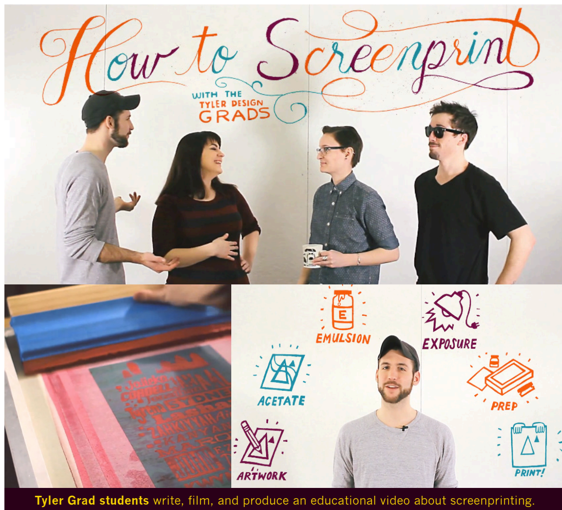
Tyler Grad students write, film, and produce an educational video about screenprinting.

The students will collaborate in groups to decide the content, layout, and color scheme for their poster while the graduate mentors guide them in the brainstorming process (as well as sharing insight into line, color, composition, and other elements of design).